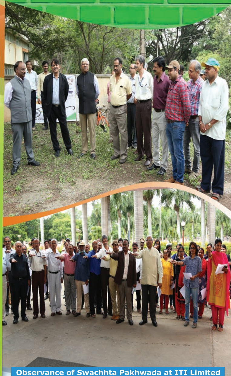
Observance of Swachhta Pakhwada at ITI Limited