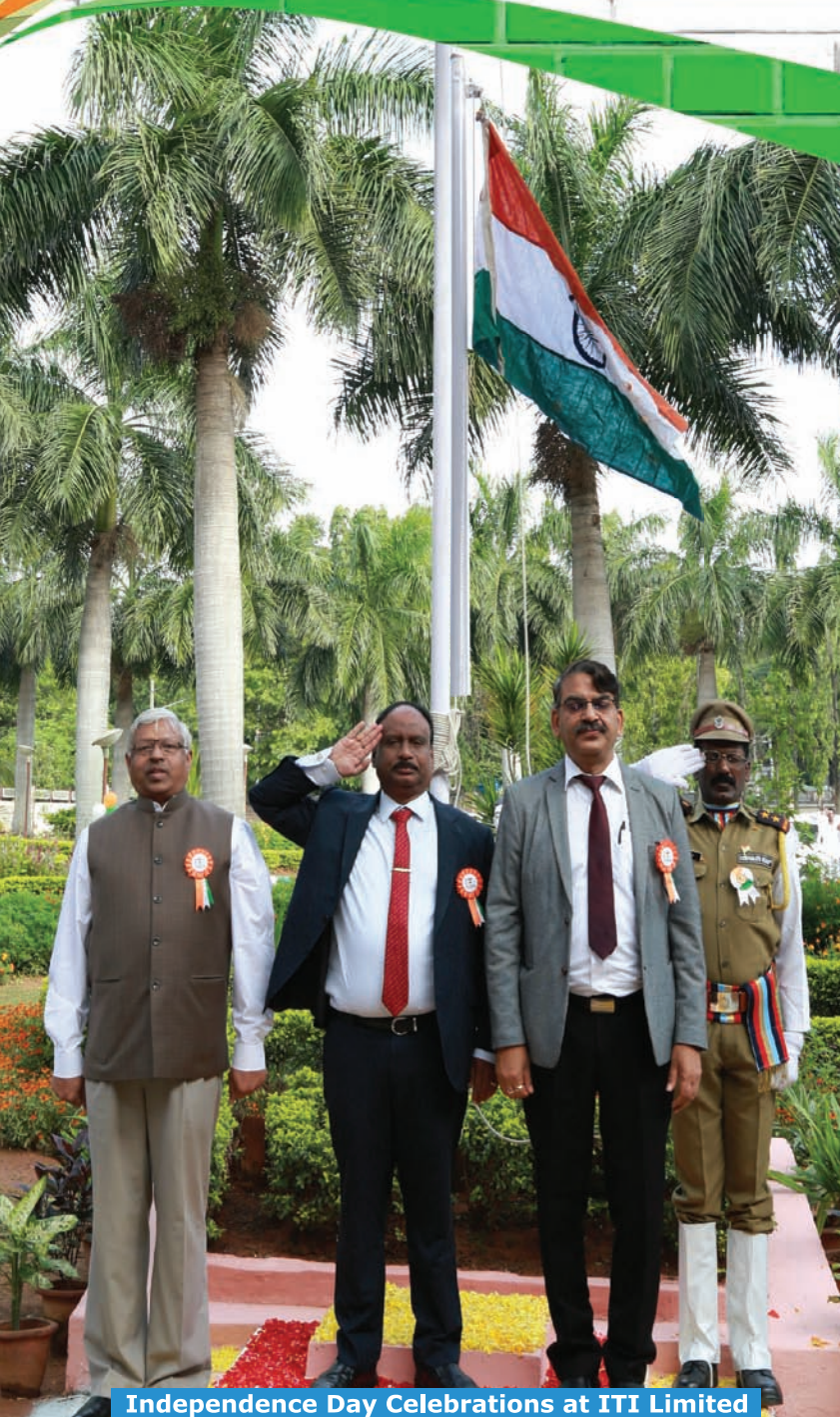
Independence Day Celebrations at ITI Limited